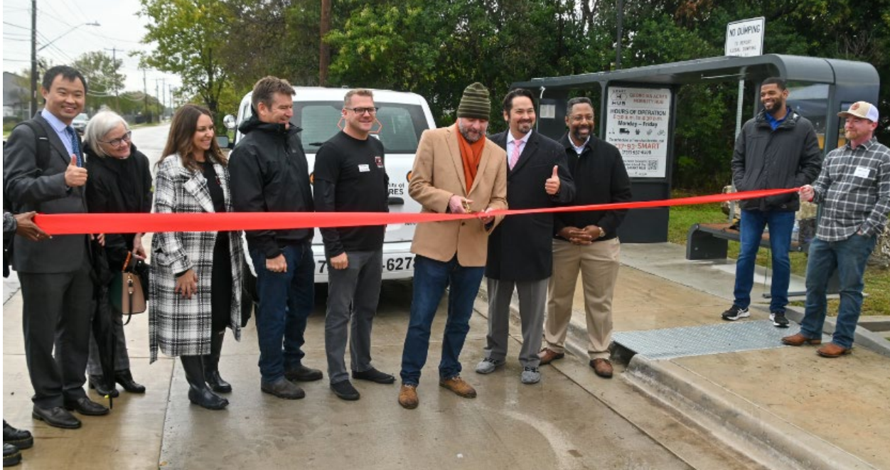
Officials from the City of Austin, The University of Texas at Austin, and nonprofit Jail to Jobs cut the ribbon to inaugurate the Georgian Acres Community Hub for Smart Mobility on East Wonsley Drive.