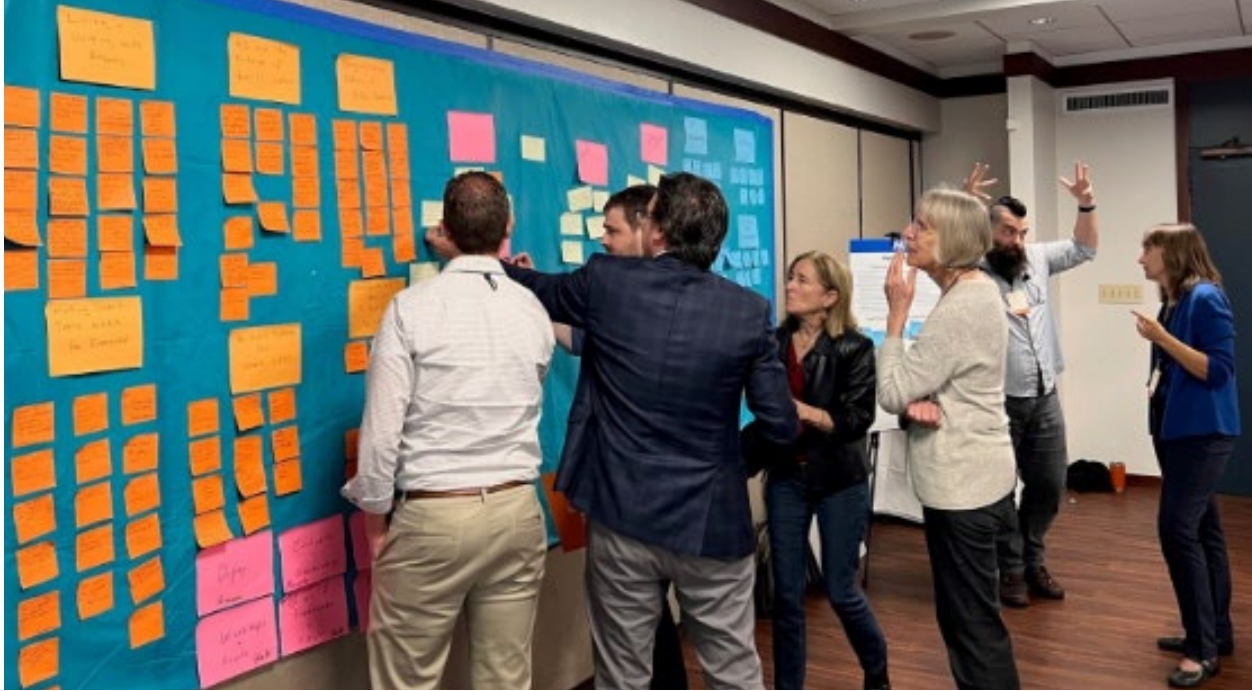
Workshop participants identify potential projects.